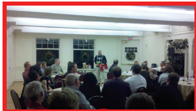
Seattle King County Holiday